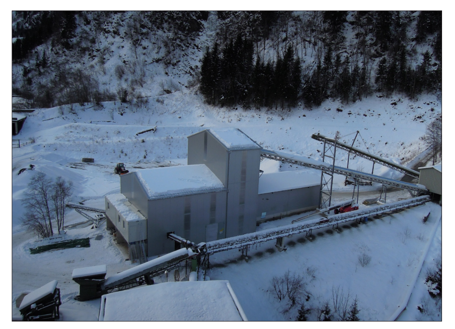
Figure 2. Sorting island installed at the Mittersill tungsten mine in Austria.<sup>1</sup>

even though a Sampling Error may be minimised according to the TOS.